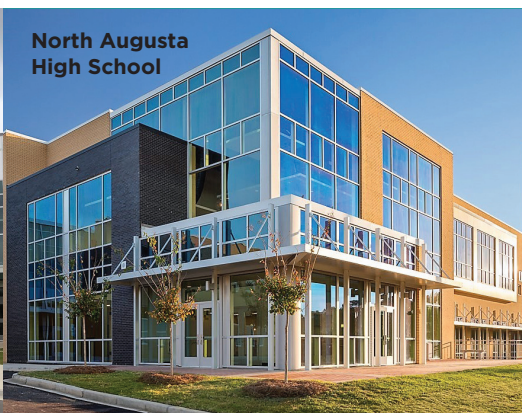
North Augusta High School